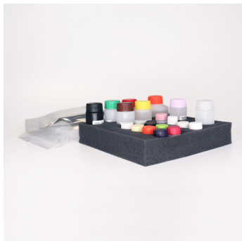
N8-Acetyl-Spermidine ELISA kit