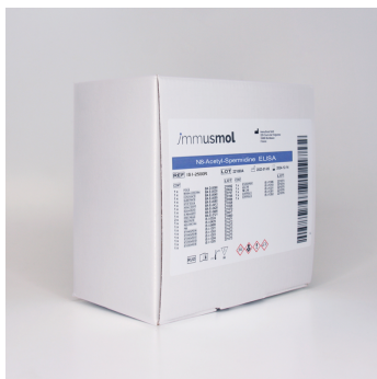
N8-Acetyl-Spermidine ELISA kit