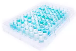
Plasma Normetanephrine ELISA