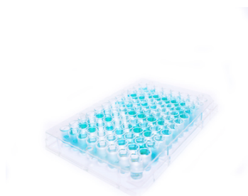
Plasma Normetanephrine ELISA