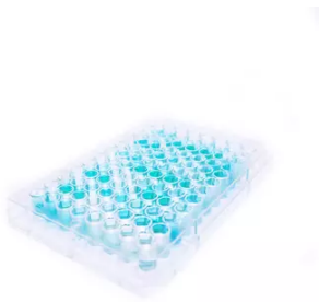
ELISA kit for urinary Metanephrine detection