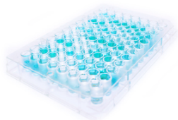
Plasma metanephrine ELISA kit