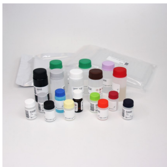
5-HIAA Elisa kit