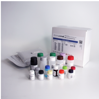
5-HIAA Elisa kit