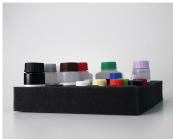
5-HIAA Elisa kit