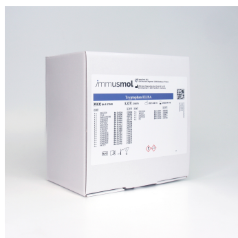
Tryptophan ELISA kit