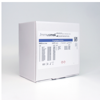
Tryptophan ELISA kit