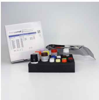
Tryptophan ELISA kit