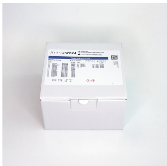
Tryptophan ELISA kit

Murine CT26 tumor cell line was stably transfected with either empty vector (Mock) or vector containing cDNA encoding for indoleamine 2,3 dioxygenase (IDO1). Cells were cultured for 48 hours and Tryptophan was measured using the Tryptophan ELISA kit. As expected, Tryptophan level was significantly lower in IDO1-proficient CT26 cells than in mock or parental (WT) CT26 cell lines.