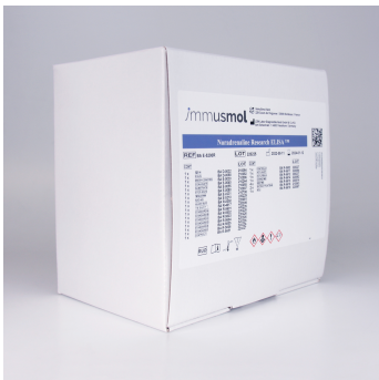
Noradrenaline Research ELISA kit