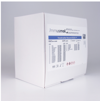
Noradrenaline Research ELISA kit