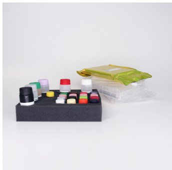
Noradrenaline Research ELISA kit