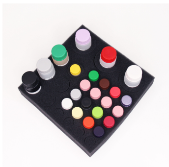
Noradrenaline Research ELISA kit