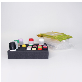
Noradrenaline Research ELISA kit