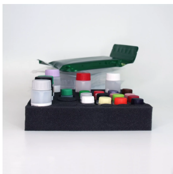
Highly sensitive Melatonin ELISA kit